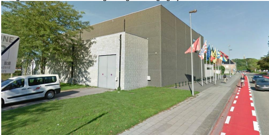
Photo1: Loading and unloading zone